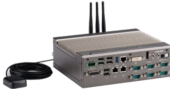
MXE-1400 with Antenna